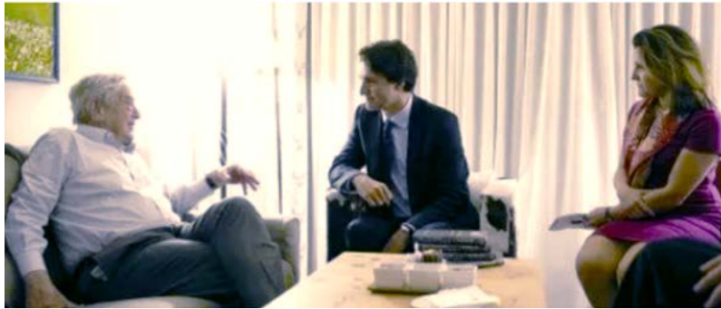
Photo posted January 22, 2016 on Chrystia Freeland's website captioned "Pleased to join Prime Minister Trudeau for a discussion with George Soros about Canada and the global economy."

George Soros, U.S. citizen of Hungarian birth, is one of the wealthiest men in the world. Over the past three decades, he has distributed over $32 billion, worldwide, through his Open Society Foundations. The budget for 2020 alone is $1.2 billion. Soros' Open Society is active in 120 countries, working through national and regional organizations, and also with opposition political parties in order to undermine pro-life and pro-family governments, such as those in Poland and Hungary.