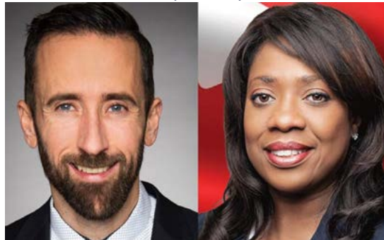
Derek Sloan, MP for Hastings-Lennox and Addington and a lawyer, and Leslyn Lewis, a Toronto lawyer.

REAL Women has now concluded that the following two candidates should be supported as Conservative leader. They are: