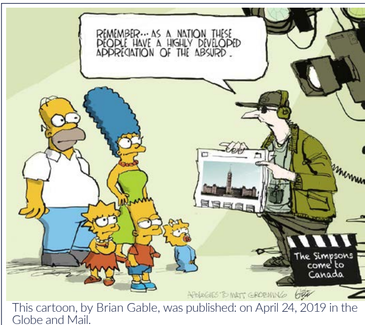
This cartoon, by Brian Gable, was published: on April 24, 2019 in the Globe and Mail.