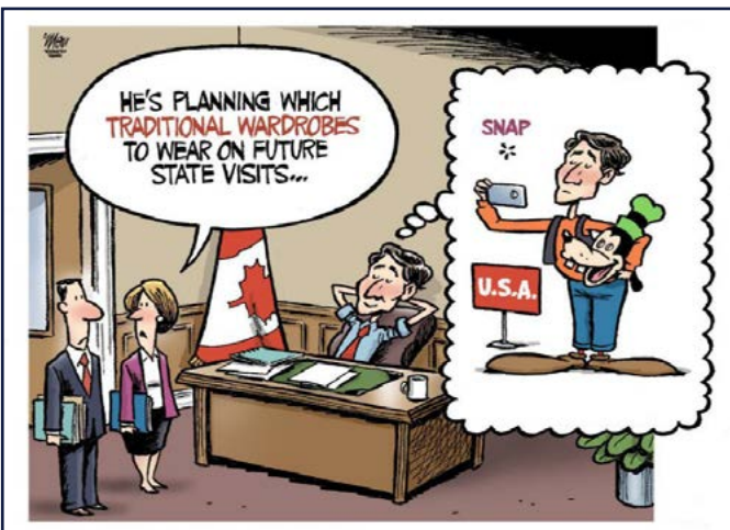
Theo Moudakis, Toronto Star, February 27, 2018, Heavy thoughts by Prime Minister Trudeau.

With Trudeau's inclination to dress up for his foreign visits, cartoonists have been helpful (see below) in providing him with ideas of what to wear on foreign visits. ♣