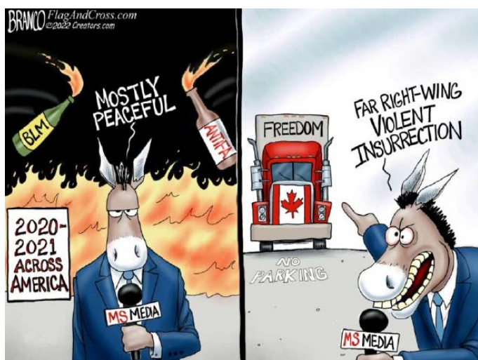
"True North Strong and Free," A.F. Branco, Flag and Cross , Feb. 9, 2022, https://flagandcross.com/true-north-strong-and-free/