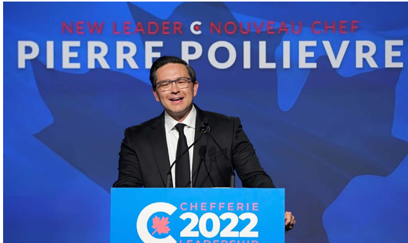
Pierre Poilievre wins Conservative leadership race