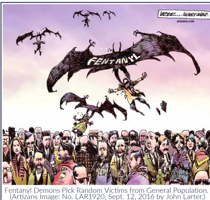
Fentanyls Demons Pick Random Victims from General Population.

The only beneficiaries of the drug epidemic are the drug industry both legal and illegal, and also those workers serving addicts as care councillors providing them with social services. †