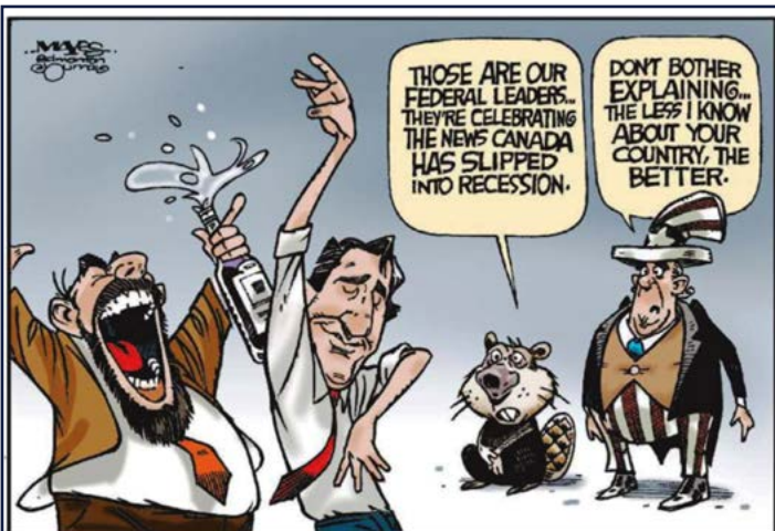
This cartoon by Malcolm Mayes was published on September 2 in the Edmonton Journal

PO Box 8813 Station T Ottawa ON K1G 3J1 | Tel 613-236-4001 | Fax 613-236-7203 www.realwomenofcanada.ca | info@realwomenofcanada.ca