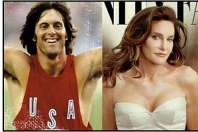
Bruce Jenner now goes by the name “Caitlyn”.

This current craze to support the transgendered reached into the realm of hysteria when 65 year old, Bruce Jenner, the former gold medal athlete in decathlon, at the Montreal 1976 Summer Olympics, who has evolved into a television celebrity, allegedly became “a woman”. He/she now goes by the kittenish name of “Caitlyn” Jenner.